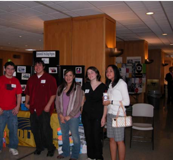
MIT pre-college students make the ETIC pitch in Salem